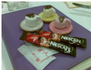
ZC Melton's creative cups raised $110 at a recent club meeting.

Nearly all District 23 clubs have donated, but we ask that you also ensure that one third of club funds raised for the biennium go to ZIF.