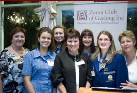
Award recipients at Geelong's Awards Dinner

Barwon Health and the Wathaurong Community.