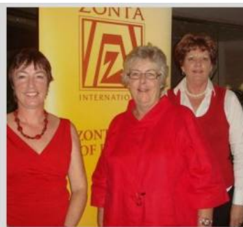
Darwin celebrated IWD with the Red Cross but...who's that below?