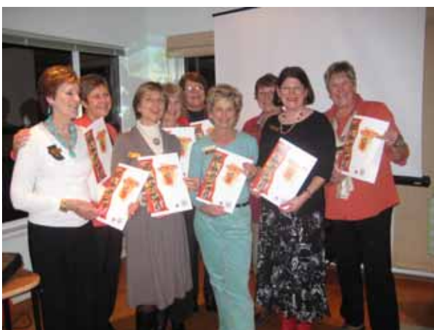
Board members receive personal copies of the Yarri Wada Pack to encourage sponsorships!