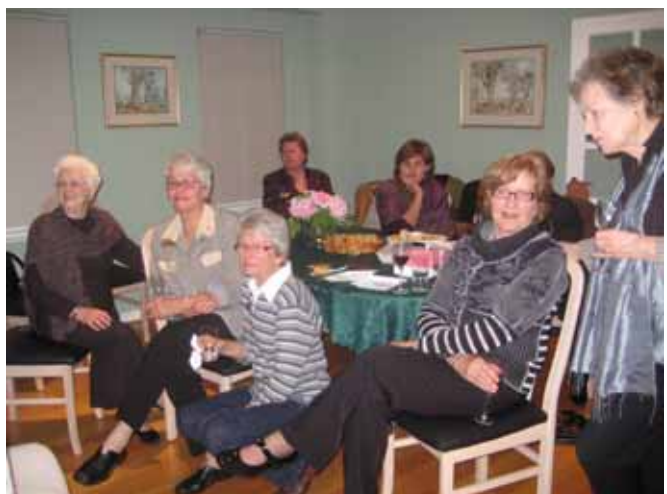
Zontians watch the Board 'hamming it up' for the camera!