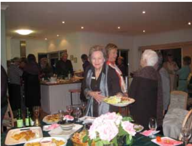
After the formal proceedings, local Zontians brought in platters of food for an informal 'Meet the D23 Board' party