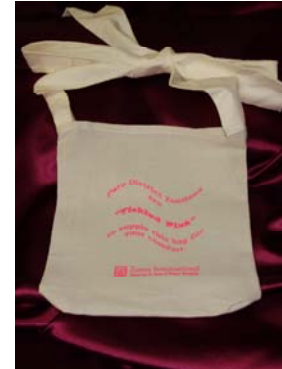
Tickled pink bag

Early in November, 2008, president of the Zonta Club of Para District Area, Alexa Little, was pleased to present twenty "Tickled Pink" bags