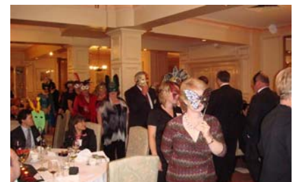
Colourful Masks at International Night with an Italian Flavour