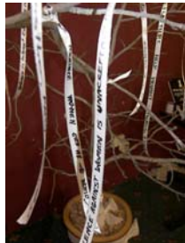
White ribbon tree

Riverland: Raising awareness with White Ribbon Tree —As the Riverland area is facing severe drought conditions which are proving very stressful, the Zonta Club of the Riverland held a White Ribbon Fashion & Pamper Show to provide an afternoon of relaxation.