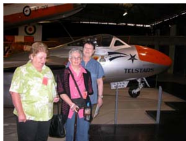
Zontians visit Point Cook Air Force Museum

The Amelia Earhart celebrations were held at Point Cook Air Force Museum on January 17, 2009. Members were shown a short film on women joining the forces in WW2 arriving in normal clothes and then marching in unison in their uniforms. In March 1941 a call went out to volunteer for service. There were 42