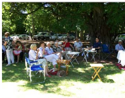
Having breakfast in the park raised over $1,000 for Amelia Earhart Scholarships!

On a perfect summer morning Adelaide was already buzzing with the Tour Down Under cycling event when over 100 people of all ages began our celebrations. Relaxing on the grass under the shady plane