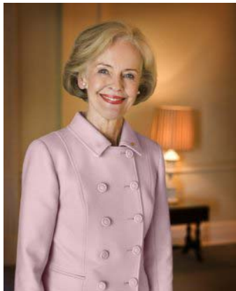
Governor General Her Excellency Ms Quentin Bryce AC—honorary Zontian.