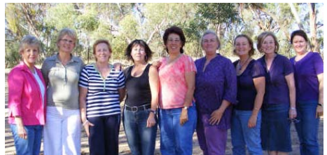
Gawler members—refreshed and invigorated!

The Zonta Club of Gawler recently held its Planning Day at Sandy Creek Conservation Park. The day was well attended and the peaceful environment was a source of great energy and commitment.