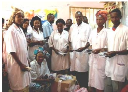
Above: A gathering of women whose babies were born with kits from Ha Giang province Vietnam near the China border in the mountains. Below: Kits arriving in Chad.

The BKFA board wants every Zonta club to know that none of this would have been achievable without your continued enthusiasm to fund and hold more assembly days.