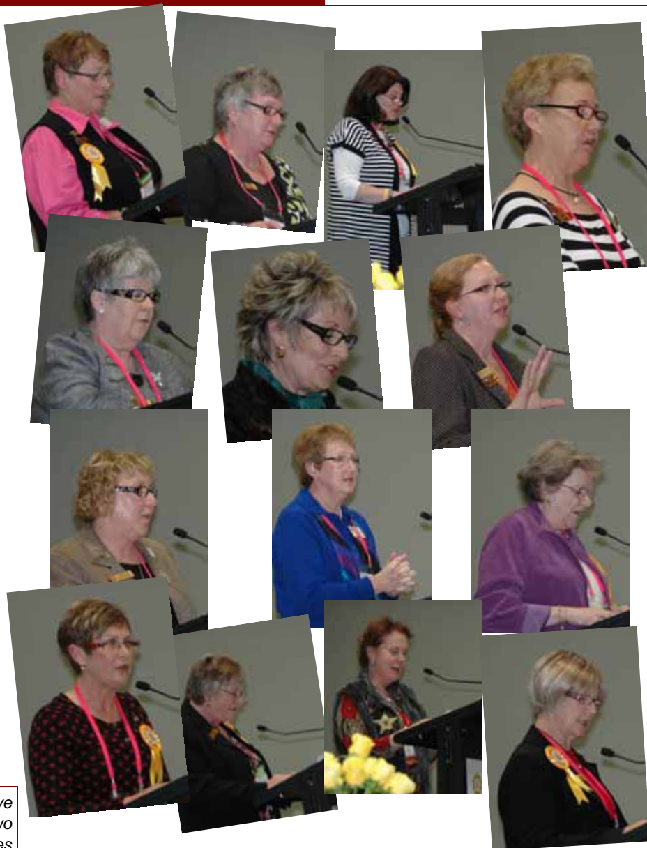
Photos on right: The impressive candidates present their two minute speeches