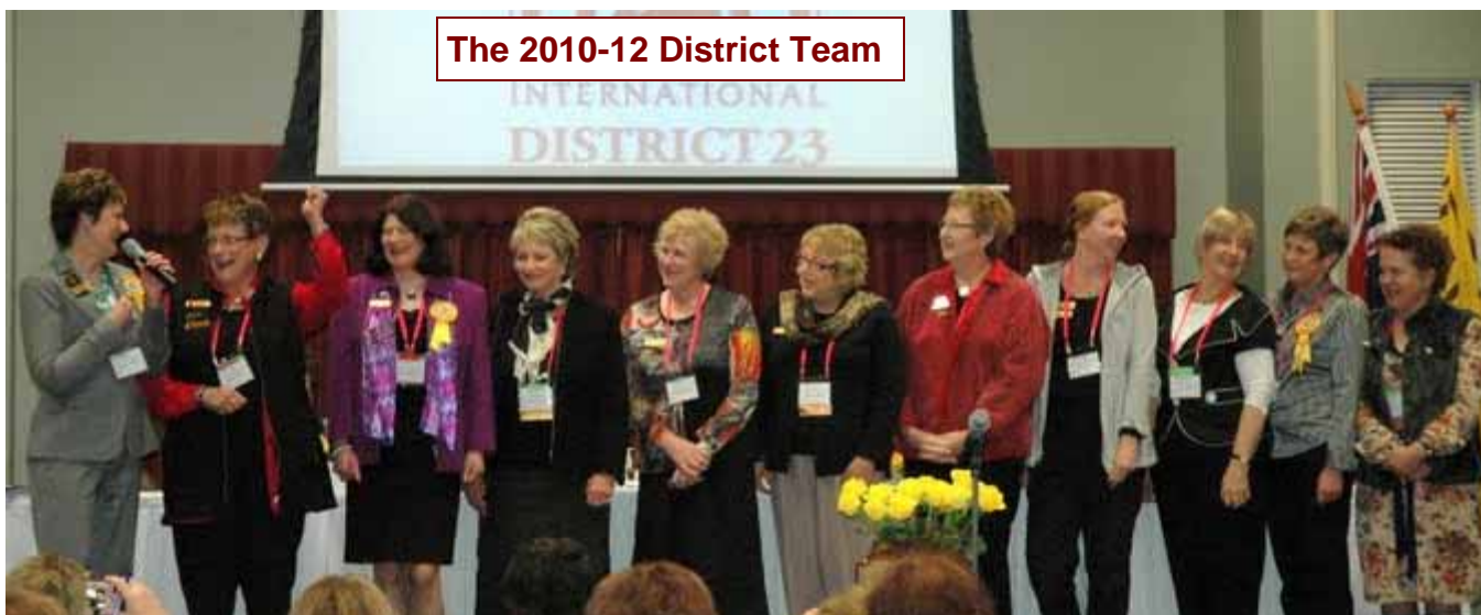
The 2010-12 District Team