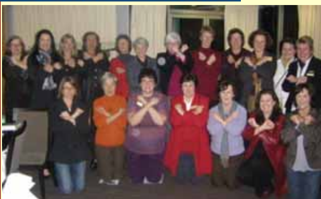
Above: Members of the Zonta Club of Port Lincoln say NO – UNITE to End Violence Against Women.

Meanwhile Zonta Club of Clare and Districts members put on a White Ribbon breakfast urging the community to take a stand against violence towards