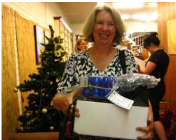
A bushfire affected woman in Eaglehawk accepting the gifts of love including the blue Christmas balls from the ZC of Kyneton.