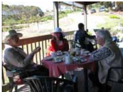
High Tea at Ross Roses