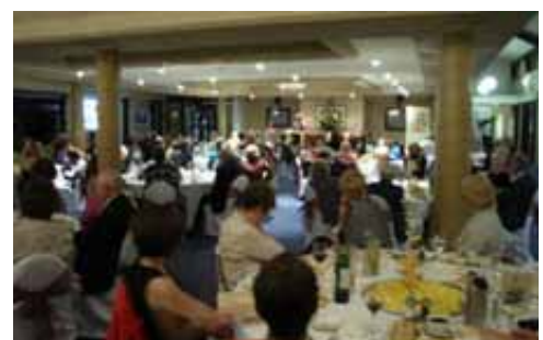
Photo below: A total of 97 Zontians, awardees and friends attended the Area 3 Founders' Day Dinner and Awards Presentation event.