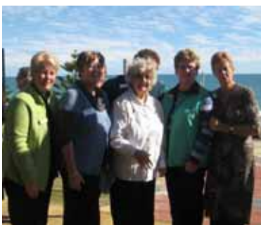
Area 3 Workshop—Zontians step out onto the balcony after lunch for some ozone!

The Area 3 Workshop, co-hosted by the Zonta Club of Perth, was entitled Footprints in the Sand, Walking with Zonta—a very apt name considering the venue was on the beach overlooking the ocean.