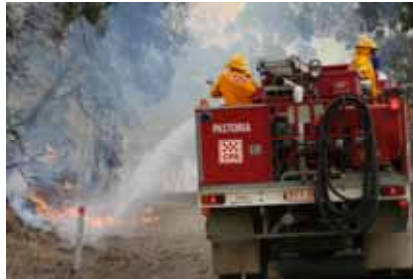
The Pastoria Fire Brigade in Redesdale Victoria on Black Friday.

I was unable to attend the 2010 Area 1 & 4 workshop for medical reasons