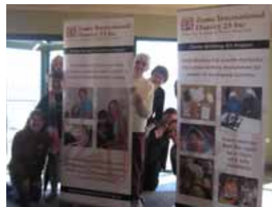
Zontians from Bunbury checked out the new banners

The program included a session on our relationship with UNIFEM, and a reflection on the success of the District 23 projects; Yarri Wada, the Breast Care Cushions and the Birthing Kits.