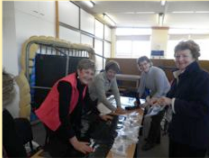
Devonport Club members at work on Birthing Kits.

following a Tasmanian trend for clubs to work more closely together to reach our Zonta goals.