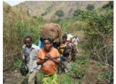
The above photo is of the trainers and helpers who have to cart 2000 birthing kits, training booklets and food for a 3 day seminar by foot for 12 hours. There is no road access to Buheba in DR Congo.