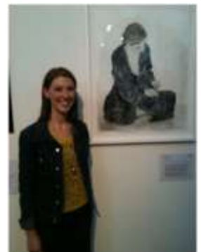
Zonta Emerging Artist award