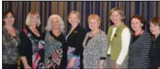
ZC of Bendigo Changeover

I have enjoyed my time as your area director and have made many new friendships. I thank all clubs for the way that you have supported me in my role and personally. Thank you.