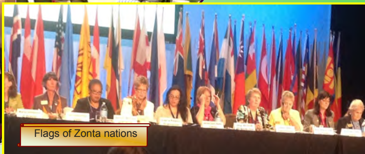
Flags of Zonta nations