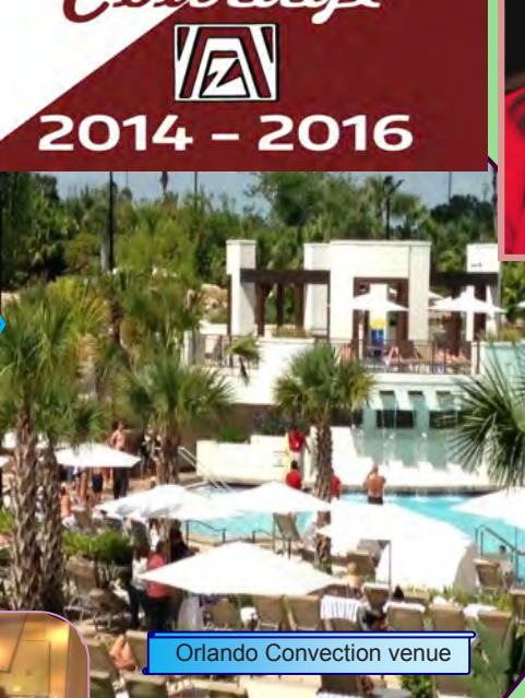
Orlando Convention venue