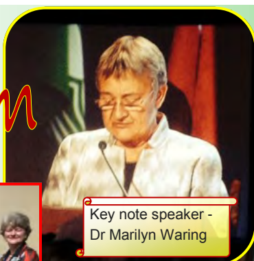
Key note speaker - Dr Marilyn Waring