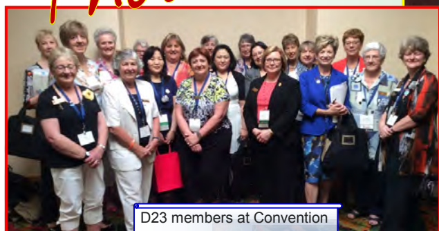
D23 members at Convention