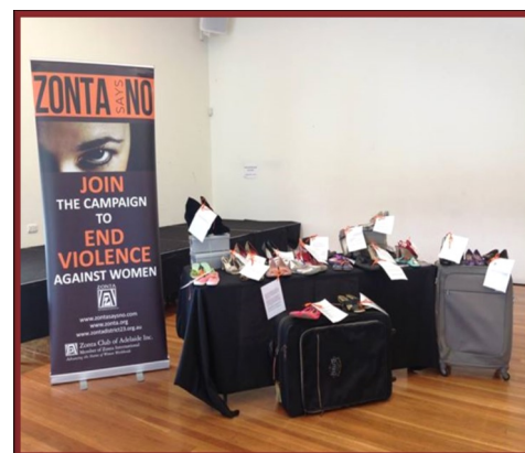
The 'Walk in My Shoes' display was acknowledged and well displayed.