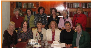
ZC Albury/Wodonga dinner meeting.

I have been able to attend every Zonta Club in Area 4 (Melton in September) by the time this goes to print. In the AD role description it states that one of the 'duties' is to visit each club. I would reword this to read, it is 'the privilege for the AD' to visit the clubs in their area for this is what it has been for me.