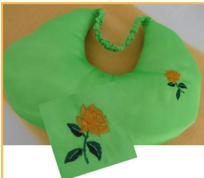
The women learn to use a high tech machine to digitally embroider the roses