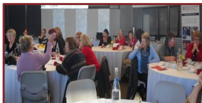
Group work Area 5 Workshop

Activities keeping us busy are birthing kits and breast cushions, cooking community dinners, Blue Illusion fashion events, multicultural dinners and great fellowship.