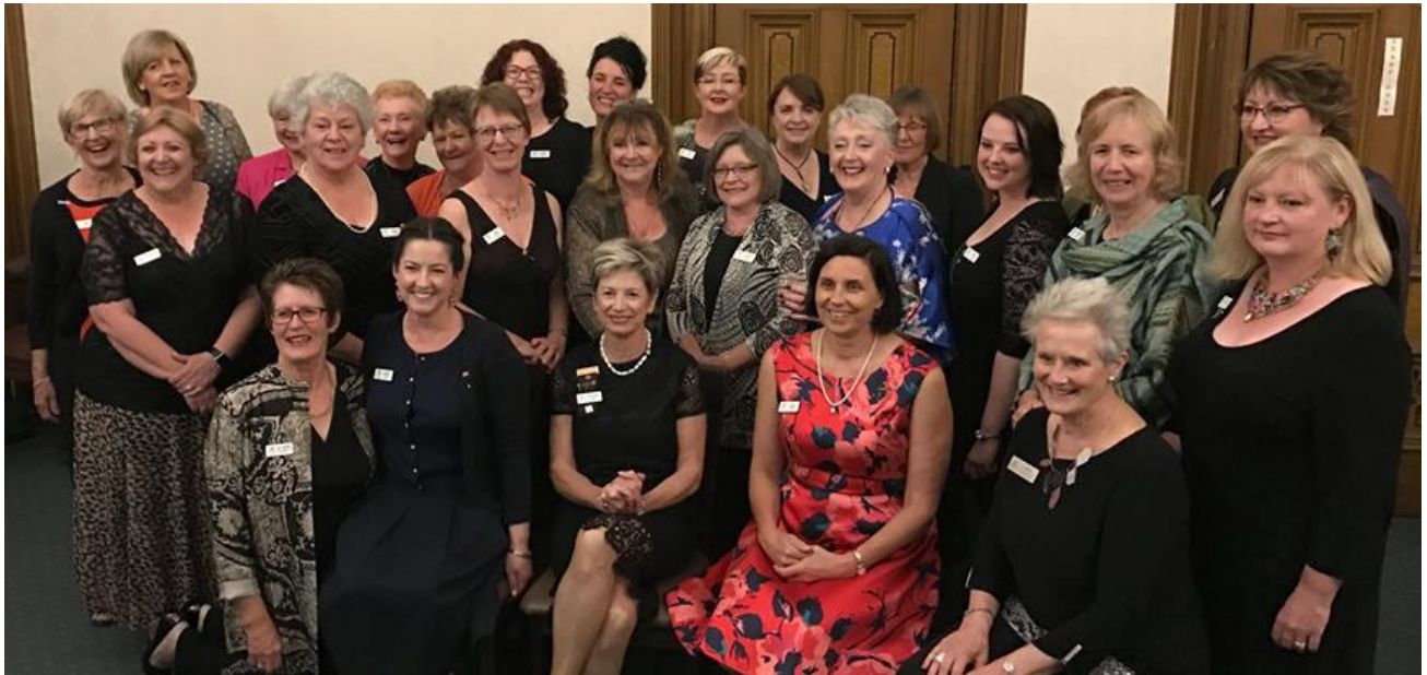
Zonta Club of Mitchell Charter