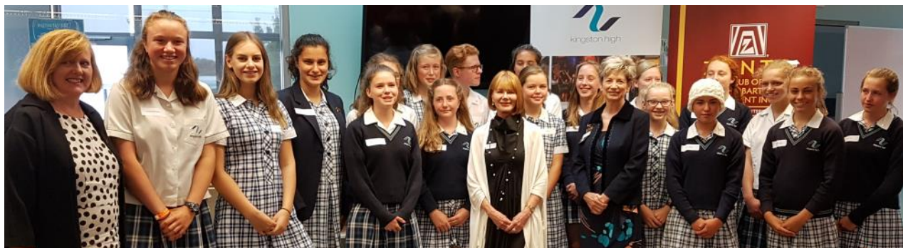
Charter of the Z Club of Kingston High School