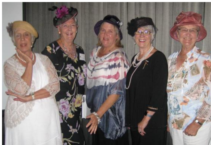
'Hat of the Era' - Zontians enjoying Peel's Amelia Earhart evening