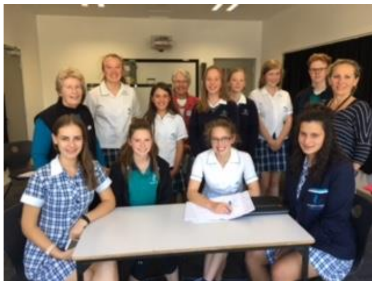
Kingston High School Z Club sponsored by the ZC Hobart/Derwent chartered on 20 March 2017.