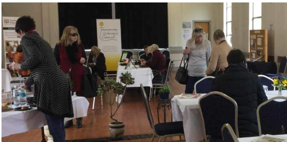
The Launceston Club's Antique, Vintage & Retro Appraisal Day.