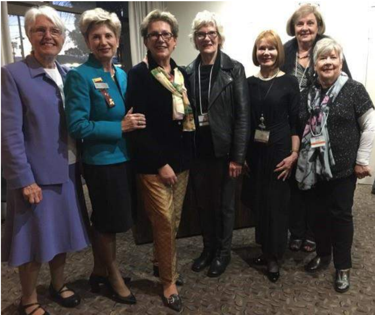
A5 representatives at Conference