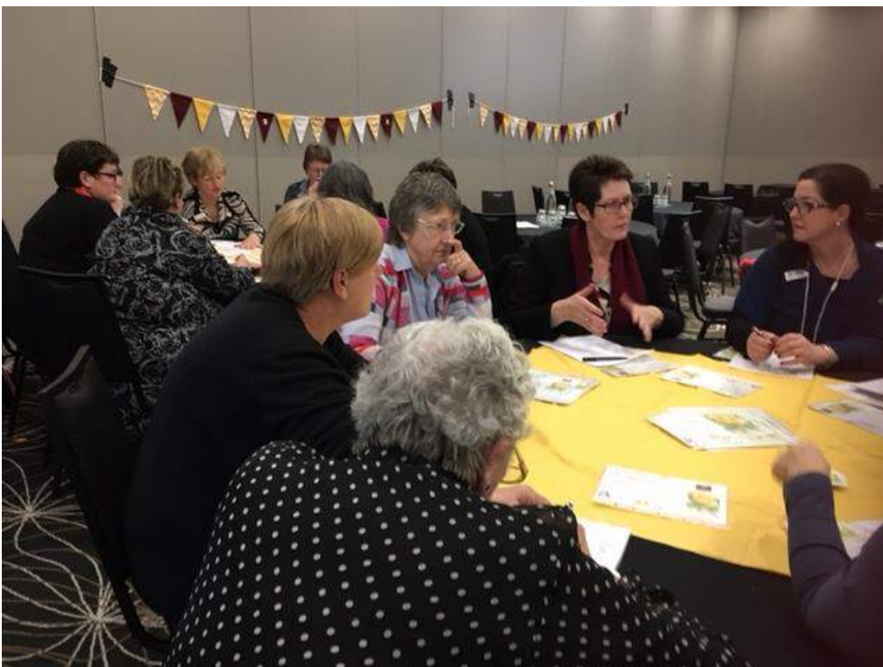
Zonta Club of Central Goldfields celebrated their 5th Anniversary recently.

I challenge you and your clubs to have your advocacy committees bring to members issues affecting women and girls that need advocating for be they local or international.