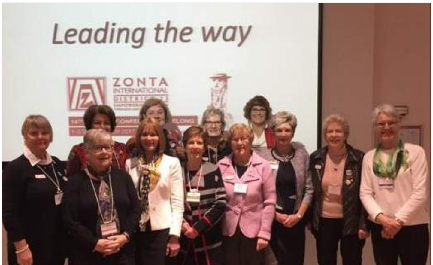
A5 representatives at Conference