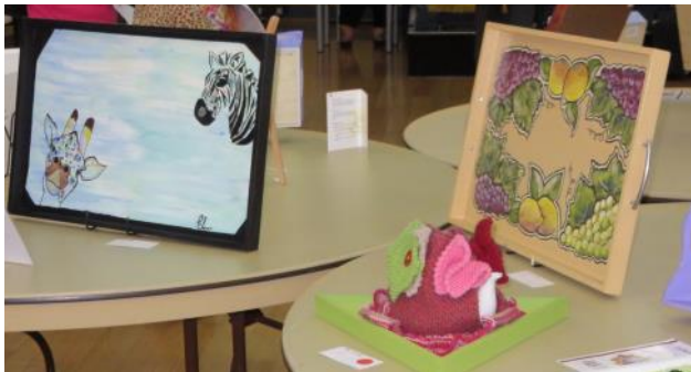
ZC Perth Northern Suburbs successful celebrity tray exhibition & auction.