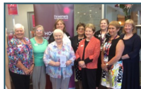
(Above) Area 1 members and (Below) Area 4 members attending Royal Women's Hospital 'FARREP' brochure launch