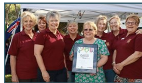
ZC of Gawler members presented with an Australia Day Award as Community Group of the Year from their Council District.