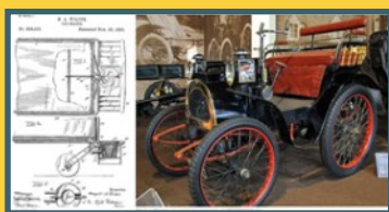
We all owe our thanks to Margaret A Wilcox who invented the car heater in 1893!