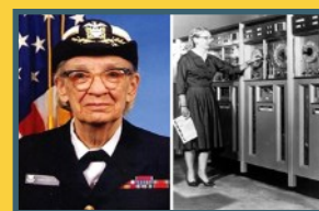
Dr Grace Murray Hopper was a computer scientist that invented COBOL which is the first user-friendly business computer software system in the 1940's.

For more amazing facts on these and many other women who have changed the World just click here