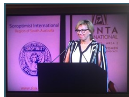
Guest Speaker Rosie Batty.