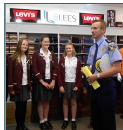
'Zonta says No' campaign - Tasmania Police Commissioner Darren Hine with a few Z Club girls from Ogilvie High School