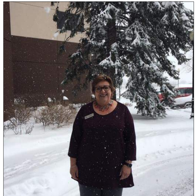
Outside the Hotel in Oakbridge, Chicago.