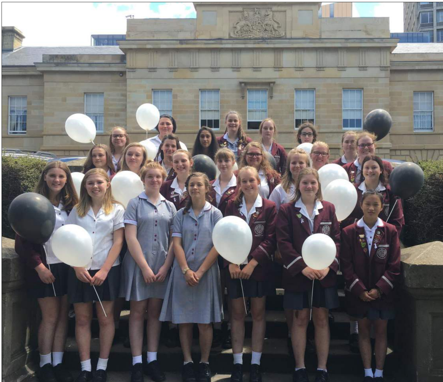
Ogilvy High School Z Club