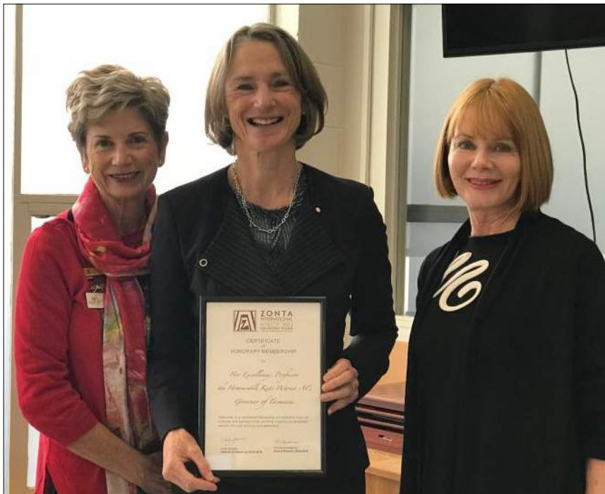
Presenting an Honorary Membership to Her Excellency Professor The Honourable Kate Warner AM. Governor of Tasmania