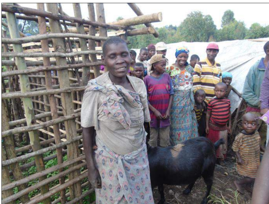
This woman is in the goat microcredit program and is a Nyingongo pygmie. She has her new two bedroom home framework beside her.