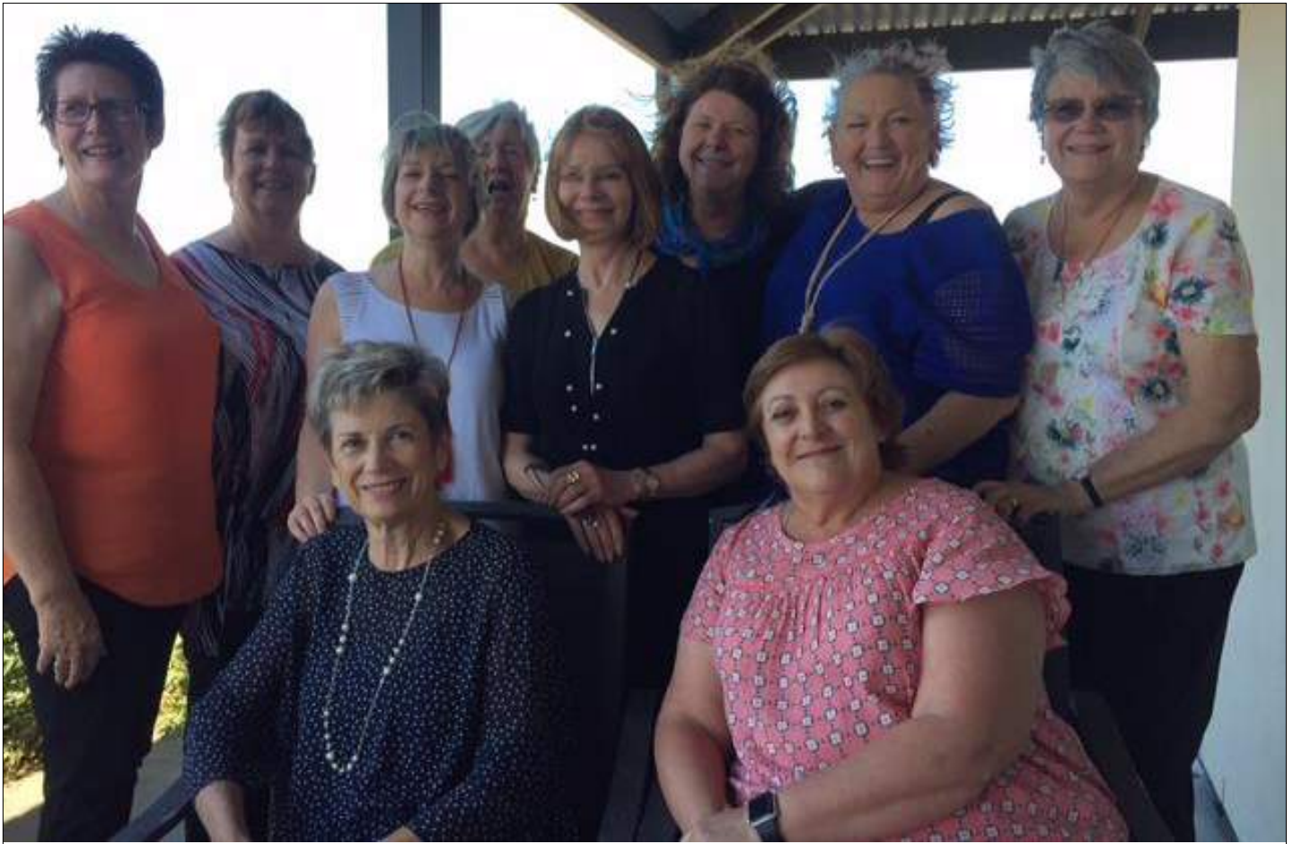
District Board meeting at Victor Harbour

Never doubt that a small group of thoughtful committed citizens can change the world. Indeed, it is the only thing that ever has – Margaret Mead