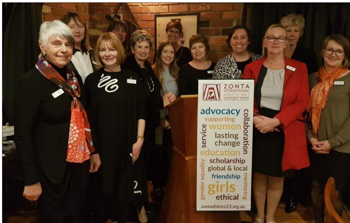
Zonta Club of Cradle Coast Installation Dinner