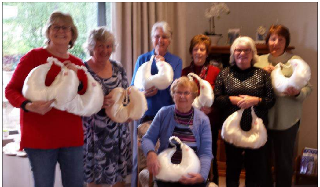
Zonta Cub of Hobart Derwent Breast Cushion sewing day.