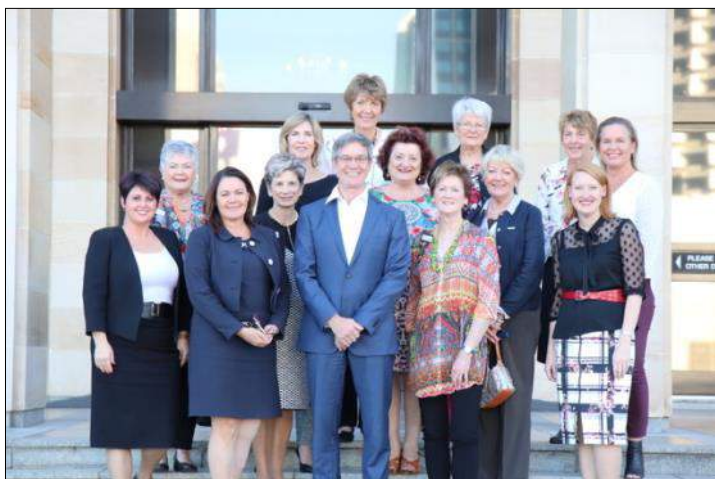
LEFT: Area 3 Zontians at Parliament House with Members of Parliament.