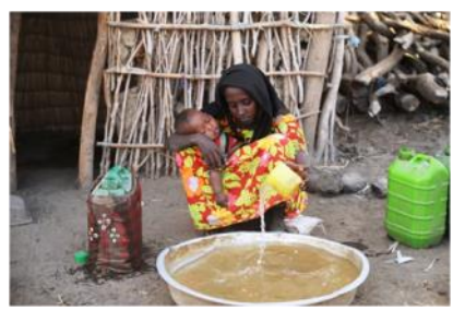
The women who receive our kits

Who would have thought that at our Zonta 100 conference in September, it will coincidentally be exactly 20 years since the first kits were made! Serendipity.