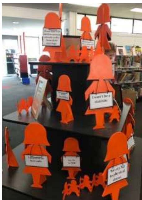
Area 1 —Speaking Out