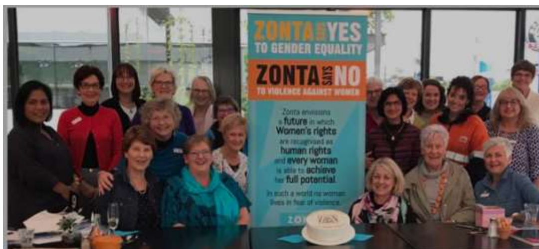
Area 5 —Zonta Club of Devonport celebrating Zonta International's Centenary

EMPOWERING WOMEN THROUGH SERVICE AND ADVOCACY