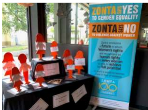
Area 5 —Zonta Club of Launceston's eye-catching Zonta Says No display with orange people made by the local Men's Shed.