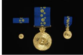
Order of Australia Medal