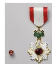
The Order of the Rising Sun, Gold and Silver Rays (5th class)

The award will be conferred on the 23 February, the birthday of the Emperor of Japan, at the Consulate-