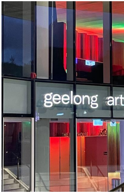
Geelong Water Board Deakin University Geelong Art Gallery

We also distributed 'orange ladies' to all libraries in and around Geelong, all three major Barwon Health sites, all local Community Health centres, as well as having a small version of an orange lady make an appearance at a City Council meeting.