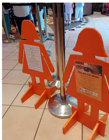
Police Orange Ladies

On the 26th of November we supplied sausages and onions to our Police who were the cooks for a crowd of around 150 people over the allotted time. We attracted good media coverage - radio, newspaper and television, and other services joined us to complete the activity with a Walk Against Violence. We repeated this in a rural town and learned that the useful little survival packs that we were supplying to our police for distribution to women on that first escape night, should also include men. In rural areas, our police find that it is safer and better to remove the perpetrator from the family home on the grounds that resources for one are more attainable than perhaps a mother and her children. So we promptly supplied packs that included a small towel, a shaver and aftershave lotion.