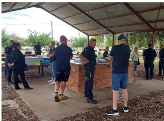
Raising Awareness Cooks