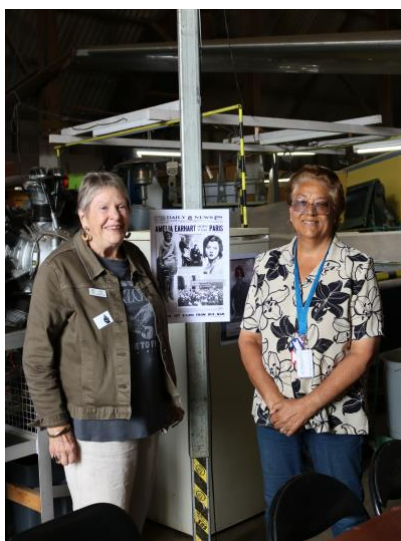
(Amelia Earhart Display)

On Sunday 21 st of January, these two clubs held their 2024 Celebration of Amelia Earhart event at the B24 Liberator Museum in Werribee. What an iconic memorial from Australia's wartime history, filled with three renovation projects including of course a B24 Liberator. The attendees, some of whom travelled a long way to attend, participated in guided tours led by the museum's knowledgeable volunteers. They got to hear stories about the training locations and activities that took place in Werribee during those WW2 years, about the restoration projects currently underway, and had the opportunity to read through the myriad of memorabilia on display.