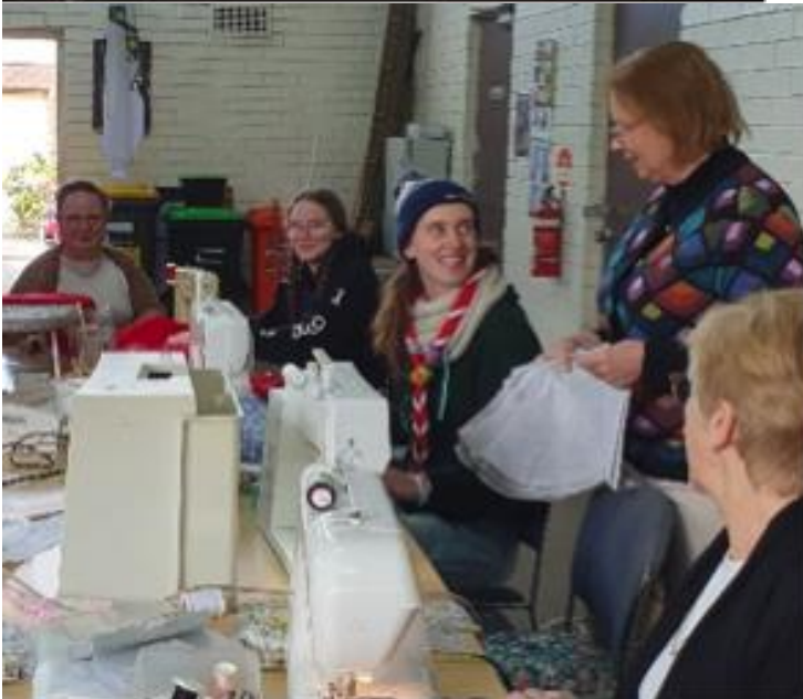
BCC Stall at Convention